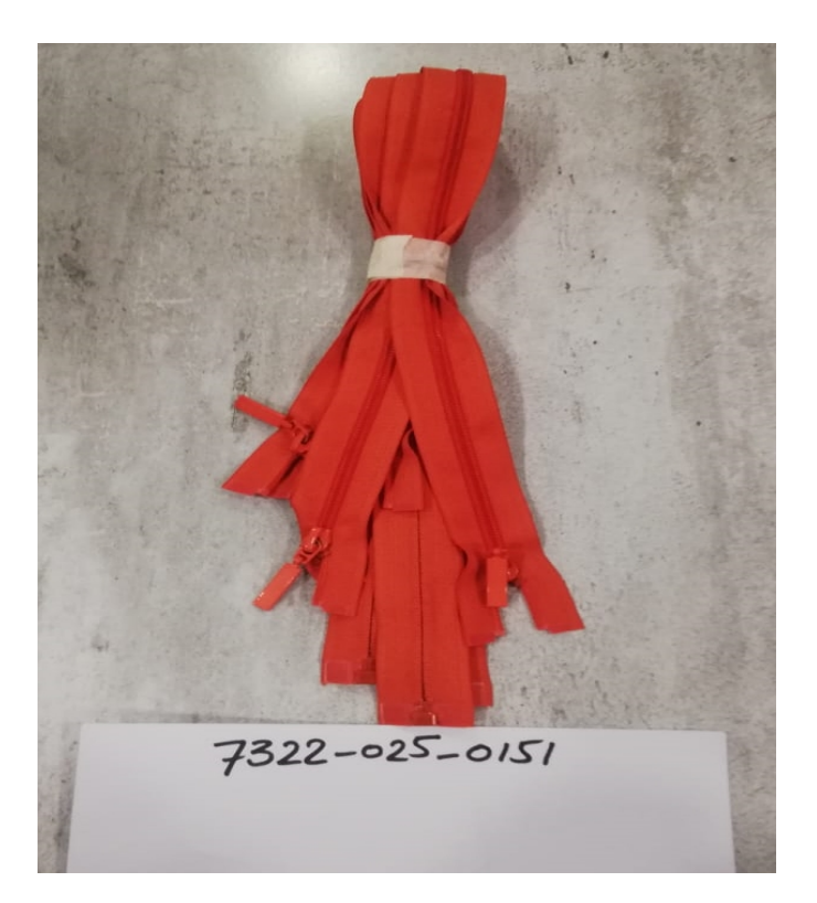
(END OF REPORT)